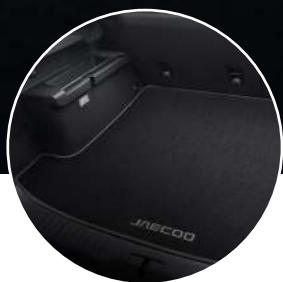
1 335 L Luggage Capacity

Drawing from the swift precision of the hunt and the sleek contours of modern design, the JAECOO J7 is primal at either end.