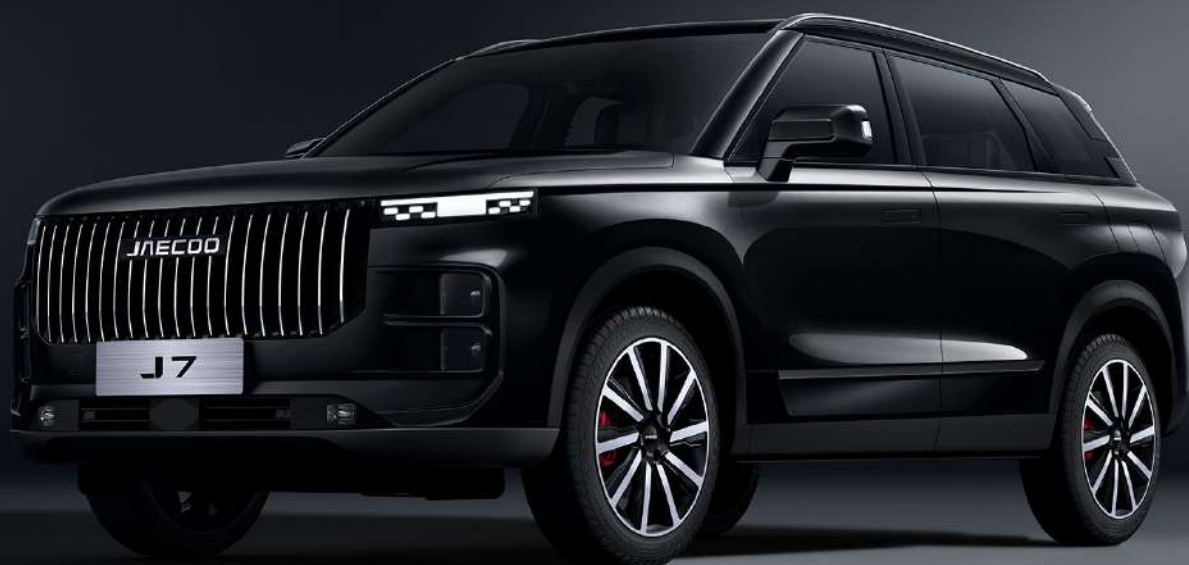
CARBON CRYSTAL BLACK