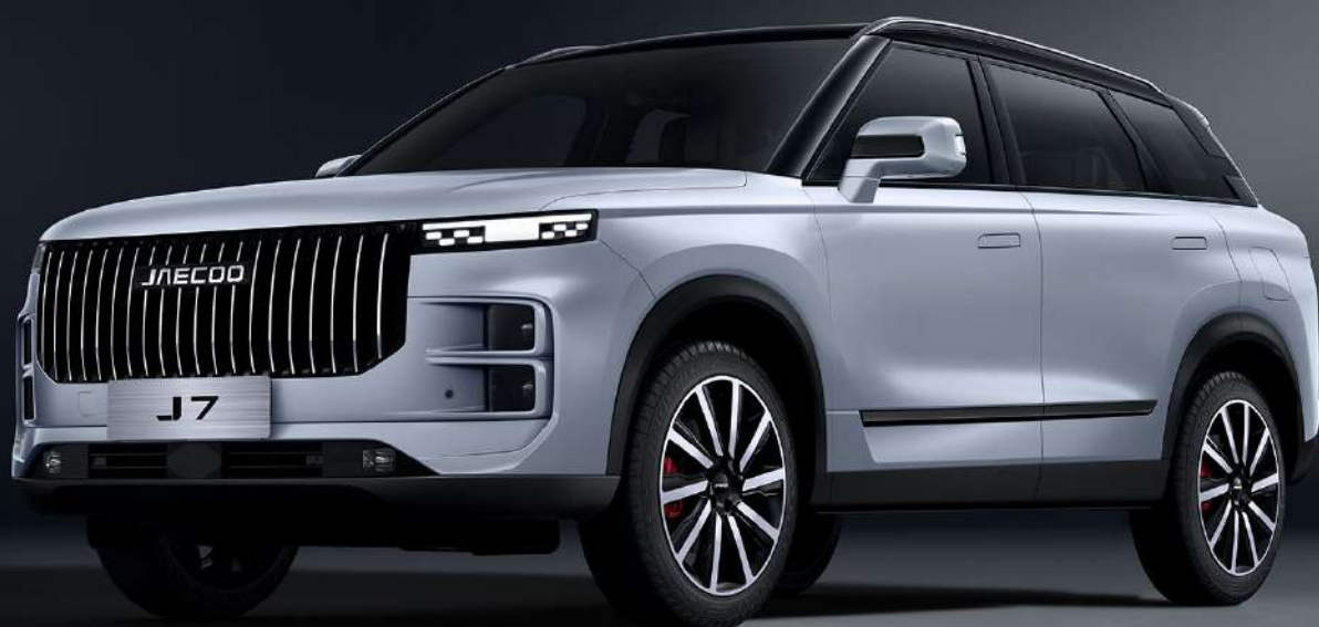
CARBON CRYSTAL BLACK & MOONLIGHT SILVER