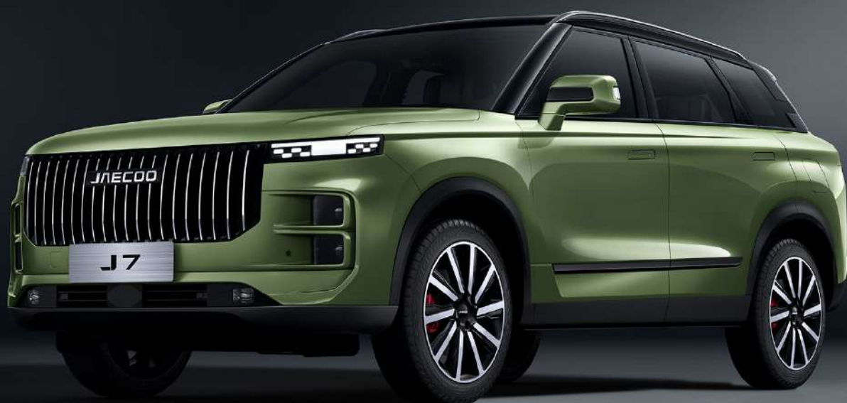
CARBON CRYSTAL BLACK & MODEL GREEN