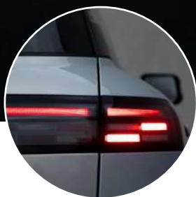
Rear LED Tail Lights