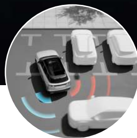
Rear Traffic Alert