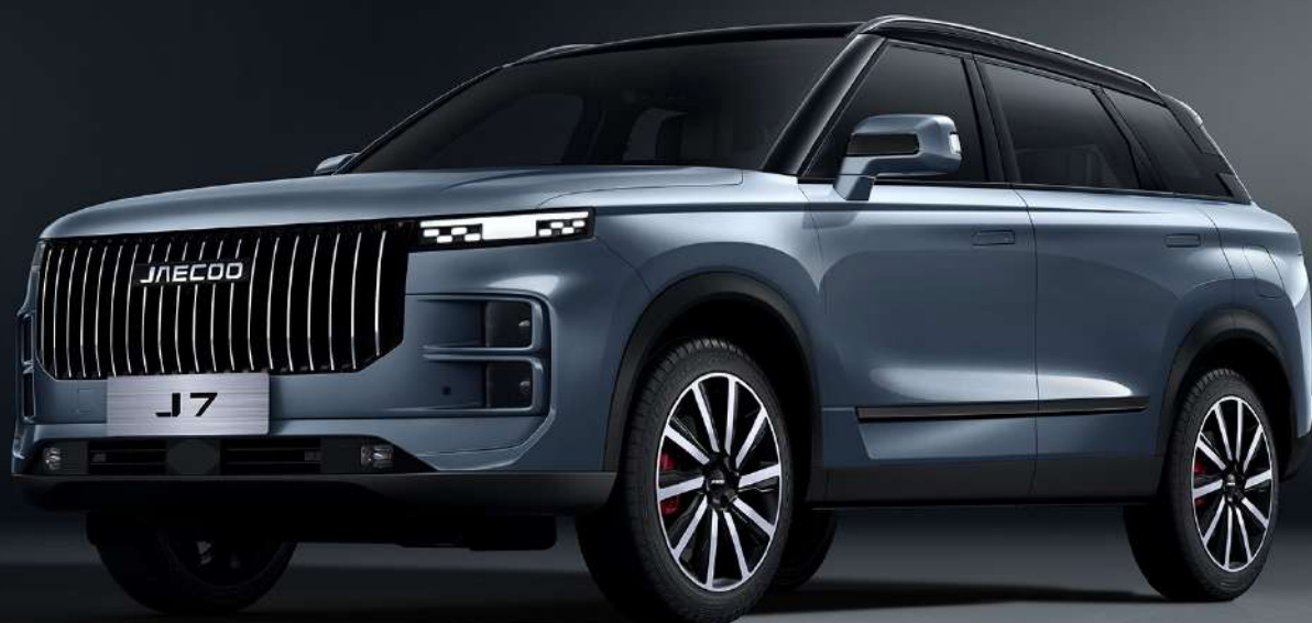
CARBON CRYSTAL BLACK & OLIVE GREY