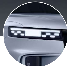
LED Daytime Running Lights