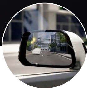
Blind Spot Detection